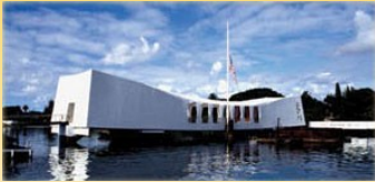
Rotary Club of Pearl Harbor