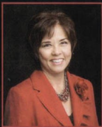
On The Cover