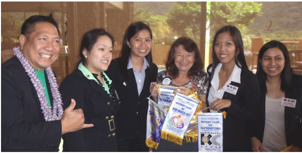
Rotary District 3780 GSE Team