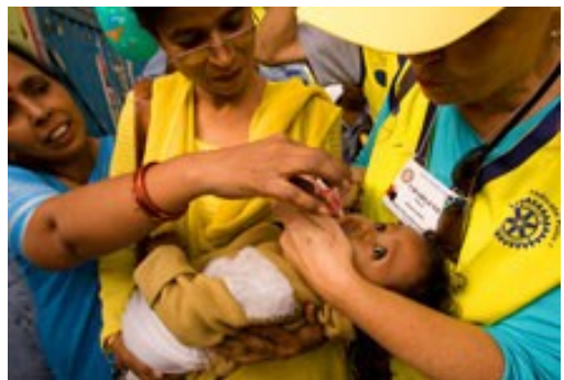
Rotarians partner together on National Immunization Day in Moradabad, India

Global grants support large international projects with