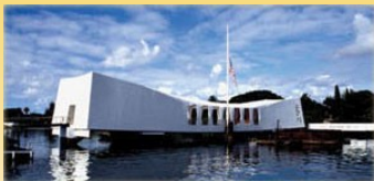
Rotary Club of Pearl Harbor www.pearlharborrotary.org