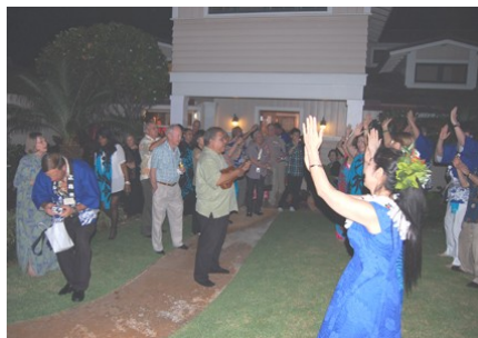
Pearl Harbor & Hiroshima Rotarians party at the Deer's home

month and was greeted by a location scout for the Hawaii 5-0 television show. The producers liked our front walkway and asked if they