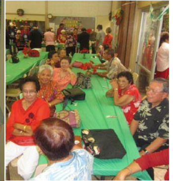
Some of the seniors listening to the entertainment