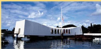
Rotary Club of Pearl Harbor www.pearlharborrotary.org