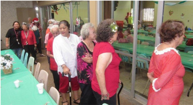
Waiting patiently at the buffet line