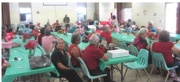
The Kalihi seniors talk story while waiting for lunch