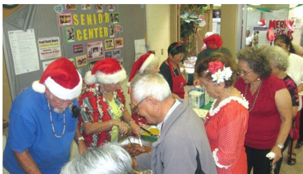
There was enough food for take-home leftovers