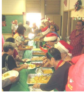
The luncheon included at least eight stations of holiday food