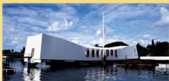
Rotary Club of Pearl Harbor www.pearlharborrotary.org